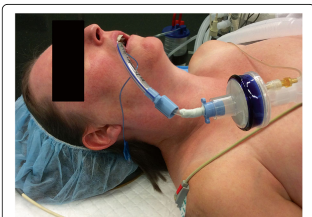
Fig. 4 Picture of patient 2. Mechanical ventilation is achieved through the Ruesch flexible intubation guide catheter connected to the breathing circuit. The 7.0 mm inner diameter (ID) endotracheal cuffed tube is left pending upstream from the vocal cords

Once trachea was surgically opened downstream from the LTS, the Ruesch guide was removed just enough to allow the surgeons to insert a 7.0 mm ID Montandon tracheal tube (Laryngoflex®, Ref. 121,181, Willy Ruesch GmbH, 71,394 Kernen, Germany) now connected to the