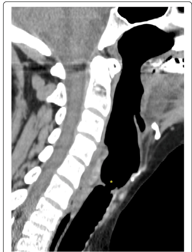
Fig. 1 CT-scan longitudinal section of patient 2's laryngotracheal stenosis (*)