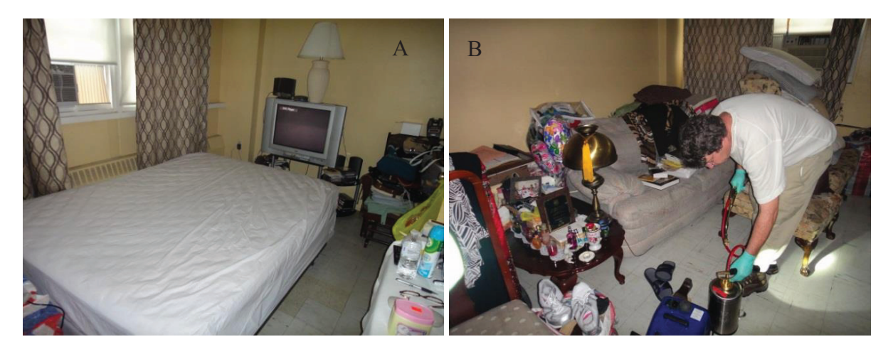
Figure 1. A typical test apartment. (A) bed area; (B) living area with a researcher using a B and G sprayer.

In each apartment, except for those in the Control, insecticide spray was applied to baseboards, holes in walls, cracks and crevices around bottom of sofas, detached headboards, and other non-sleeping areas where signs of bed bugs were seen (Figure 1B). No chemicals were applied in the Control apartments. Interceptors were installed immediately after treatment following the same manner as that for the pre-treatment monitoring.