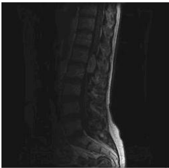
Figure 1 Ependymoma at level L1/L2 causing peripheral displacement of the cauda equina.

Six months after initial presentation he had some residual urinary symptoms but his faecal incontinence had resolved.