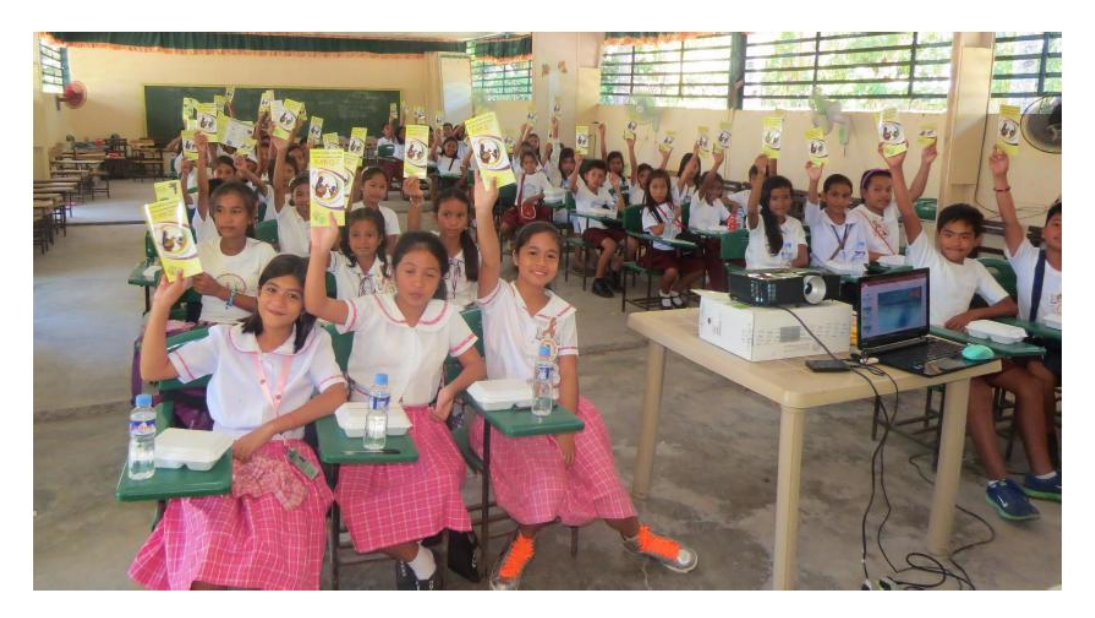
Figure 2. Rabies information dissemination campaign for elementary pupils during Rabies Awareness Month (March) in the province of Masbate.

Considering all platforms through which respondents have obtained knowledge on rabies, the common clinical signs recognized by pet owners in both dogs and humans were fear of water, aggressiveness, and drooling. Both humans and animals exhibit a fear of water or 'hydrophobia' when the animal is trying to drink water due to the spasm of the accessory respiratory muscles of the neck, pharyngeal muscles, and diaphragm followed by extension of the neck and a feeling of dyspnea [15]. When the virus has already reached the salivary glands from the brain, drooling happens due to the paralysis of this organ [16]. Since fear of water, aggressiveness, and drooling are the easiest to be observed and most commonly heard in different media outlets, these clinical signs were noted to be common knowledge from the pet owners. Interestingly, the number of people who did not have any knowledge on the clinical signs in either humans or animals decreased by three- to fourfold in the POI study. This means that increasingly, people are becoming more aware about the disease. Whilst