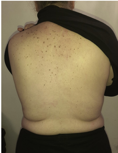
Fig 4. Complete remission at 1 year following treatment termination.

agents may prove to be effective and should be used in the future. 10