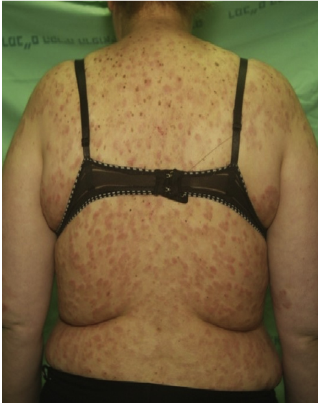
Fig 1. Multiple erythematous, edematous infiltrated plaques, some with annular configuration and raised borders, located on the trunk and extremities.