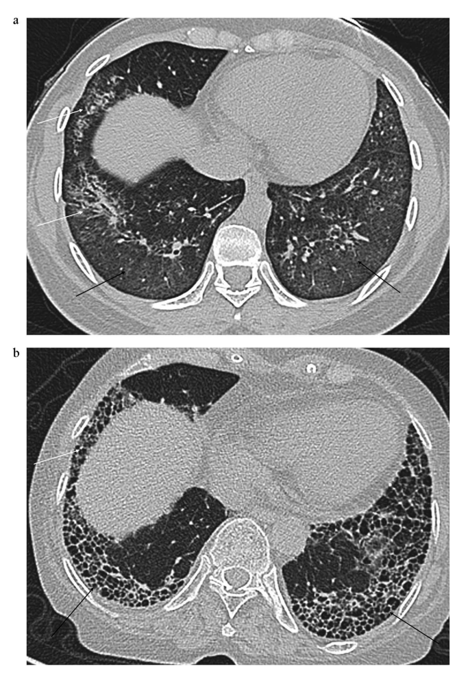
Figure 2. Representative HRCT images for RA-ILD. (a) ground-glass opacification (black arrow) and traction bronchiectasis (white arrow), (b) Honeycombing (black arrow) and reticular abnormalities (white arrow).

were a diagnosis of RA made by at least two rheumatologists according to the American College of Rheumatology 1987 criteria<sup>28</sup>. Both HRCT imaging scan of the chest and pulmonary function test were performed to assess respective abnormalities suggestive of ILD. Demographics and clinical features were extracted from the database. Patients with neoplasm were excluded. The study protocol was approved by the Institutional Review Board of West China Hospital of Sichuan University, and all participants gave written informed consent. The methods were carried out in accordance with the approved guidelines.