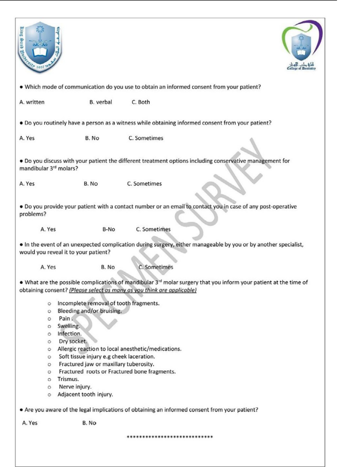
Fig. 1 Specimen survey questionnaire used to generate the electronic survey.

gender, years of experience and place of work were considered as the independent variables. Data from the questionnaire responses related to the patterns of preoperative consenting (obtaining consent, nature of consent, witness for consent, disclosing complications, and knowledge about legal implications) were regarded as the dependent variables. Crosstabulation with Pearson Chi-square test was used to identify any statistically significant associations (p < 0.05) between the independent and dependent variables.