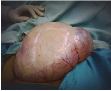
FIGURE 1: Left ovarian cyst (40 × 15 cm).