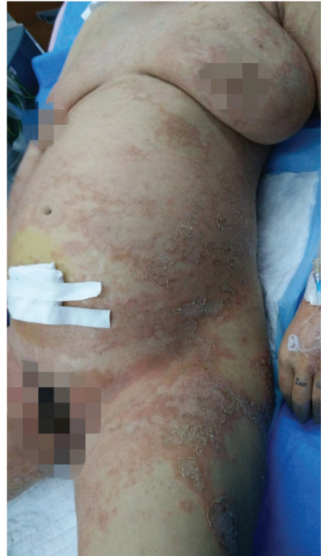
Figure 1. Photograph showing flaky erythematous lesions of different sizes symmetrically distributed over the surface of the body. A physical examination showed widespread distribution of pin-sized pustules with erosions over annular erythematous base. Some pustular lesions merged into pustular lakes.

Skin biopsy of the lesions showed spongiform pustules under the stratum corneum, acanthous hyperplasia and hypertrophy, spongy edema, and dilation of superficial dermal vessels. The perilesional areas showed moderate infiltration of lymphocytes and neutrophils (Figure 2). These findings were consistent with IH. All symptoms,