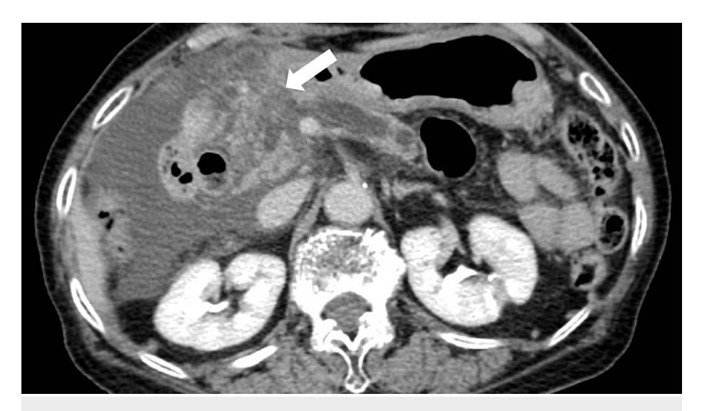
FIGURE 1: Contrast-enhanced computed tomography image of the abdominopelvic region showing an enlarged pancreatic head (white arrow)

MRI and MRCP revealed an enlarged pancreatic head with a mildly increased signal on T2-weighted imaging (T2WI). The surrounding fatty tissues showed extensive T2WI high-signal areas. The main pancreatic duct was dilated, with interrupted dilatation of the pancreatic head and body. Atrophy was observed in the pancreatic parenchyma within the caudal portion of the pancreatic body (Figure 2).