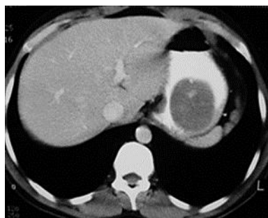
Fig. 1. CT of the abdomen after intravenous contrast medium administration demonstrated a homogeneous, round, soft tissue density mass in the stomach, with intratumoral solitary focal calcification and very smooth margins, 4.8 × 5.5 cm in size, which presented homogeneous enhancement.