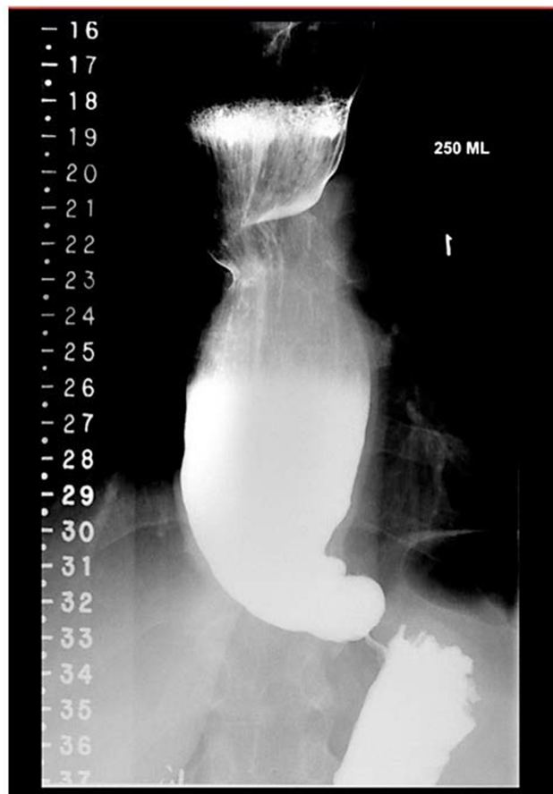
Figure 2 Dilated esophagus with retained barium and tapered bird beak appearance at GEJ.