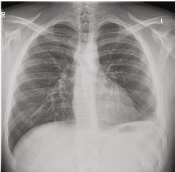
FIGURE 3: Chest X-ray taken at 2 weeks postdischarge showing clear lung fields and minimal blunting of the left costophrenic angle.

administering a further dose of 10 mg intrapleural alteplase, and placing the ICD on 4kPa wall suction. Chest CT performed four days later showed significant improvement with minimal residual fluid and near-complete reexpansion of the trapped lung (Figure 1(d)). Both ICDs were removed, and the patient was discharged the next day. Haemoglobin remained stable throughout the admission, and no blood transfusions were required (Figure 2). On follow-up two weeks later, the patient had made a full recovery with CXR demonstrating minimal blunting of the left costophrenic angle (Figure 3).