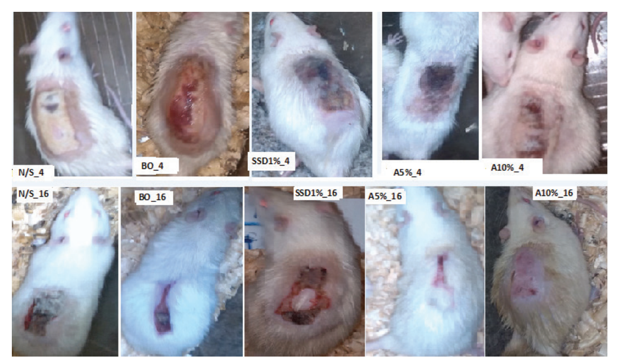
Fig. 2: Burn wound healing patterns in Normal saline (N/S), ointment Base (BO), 1% silver sulfadiazine (1% SSD) and 5 and 10% Arnebia euchroma ointment (5% A, 10% A) in rats after 4 and 16 days. Average wound size was smaller and the healing rate was faster in 5% A and 10% Arnebia euchroma ointment than other groups; p<0.001.