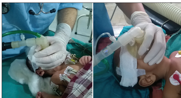
Figure 1: Glass holding technique of mask holding demonstrated in a neonate (left) and an infant (right)

This method of holding the mask was incorporated into practice after accidental use as a rescue technique in difficult