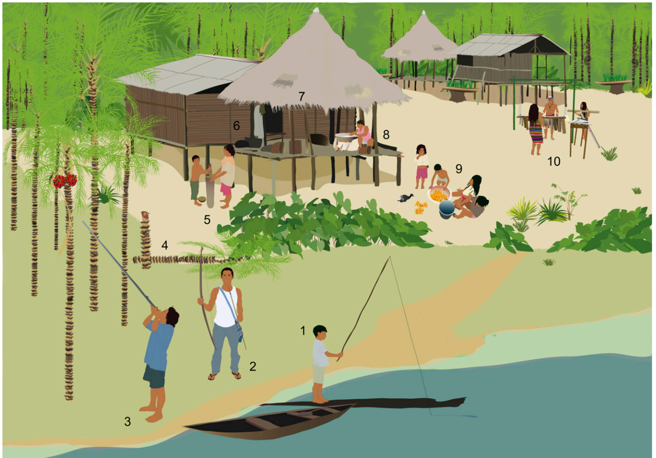
Fig. 1. Indigenous knowledge of plant services. Daily life in indigenous communities where palm products play a central role: (1) Macuna using Astrocaryum jauari fruits as fish bait. (2) Tikuna selling a souvenir bow made from Iriartea deltoidea stem. (3) Carijona using Iriartella setigera blowgun to hunt. (4) Edible beetle grubs from the felled and decaying stems of Bactris gasipaes . (5) Yucuna using mortar made from the stem of Bactris gasipaes to pound coca leaves that are ritually chewed. (6) Split Socratea exorrhiza stems as house walls and floors. (7) Embera house thatched with Welfia regia . (8) Cofán extracting edible oil from Denocarpus bataua fruits. (9) Achuar eating Mauritia flexuosa fruits. (10) Tsa'chila playing the marimba instrument made from Iriartea deltoidea stems. Image courtesy of Susana Cámara-Leret (artist).

relative contribution of biological and cultural heritage was similar, at ~50% (range, 0.15–0.91 and 0.09–0.85, respectively; Fig. 3B). In other words, variation in the realization of ecosystem services in the study area is as strongly constrained by turnover in the biological and the cultural dimensions.