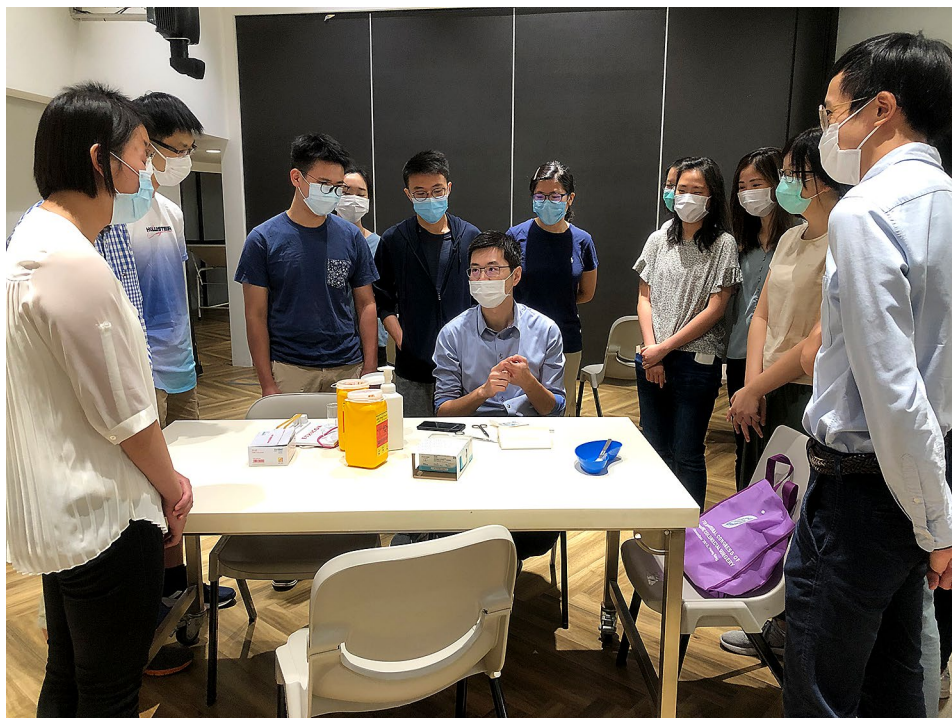
Fig. 3 Setup for the web-based surgical skills learning session (WSSL)