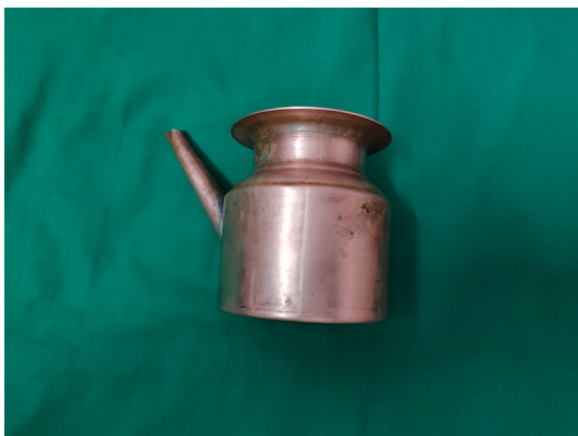
Fig. 1 Traditional Neti pot but disposable ones are available

Jal Neti kriya is an integral part of shatkarmas-six actions of purification of the human body, written in the Yogic system of healthcare [1, 3]. It involves pouring water in one nostril and flushing out through the other nostril with the help of special equipment called “Neti pot” (Fig. 1), to keep the nasal passage clean. It is also highly beneficial in