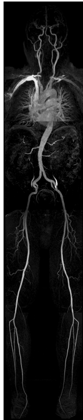
Figure 3 Coronal (MIP) of a subtracted whole-body MRA (two step contrast injection protocol, four overlapping field of views (FOVs)).

The most feared donor-site complication in fibula flap harvest is foot ischemia secondary to sacrifice of the peroneal artery. In patients with peripheral arterial disease or congenital variants (absent or hypoplastic tibial artery, peroneal artery magna, etc.), the peroneal artery may be the dominant blood supply of the foot [18].