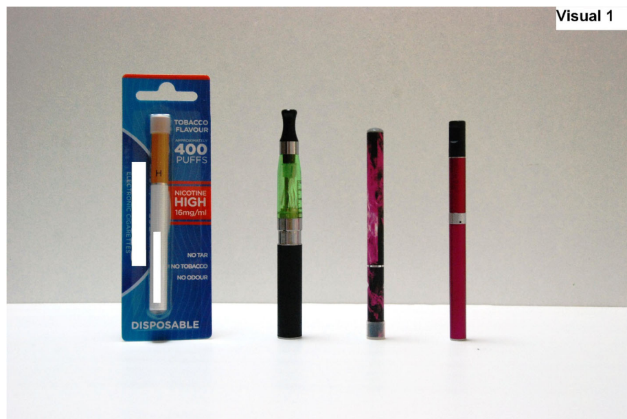
Fig. 1 Visual prompt used in the survey to illustrate different styles of e-cigarettes

Research between April and July 2014 informed the development and refinement of the e-cigarette measures. Initially, six focus groups were conducted with 11–16 year olds to explore their knowledge of e-cigarettes, how they think about and respond to them, and the language and meanings they attach to them. A draft questionnaire was developed from the emerging themes using, as far as possible, the terms the young people used. This was piloted with 11 participants aged 11–16 years. Two professional market research interviewers were involved in administering the pilot questionnaire. Each interview was observed by a member of the research team, to test the flow of the questionnaire, timing, and comprehension of questions and visual stimuli. On completion of the questionnaire, the interviewer left the room and the researcher conducted an in-depth cognitive interview to assess participant understanding of the measures, relevance of questions and ability to respond.