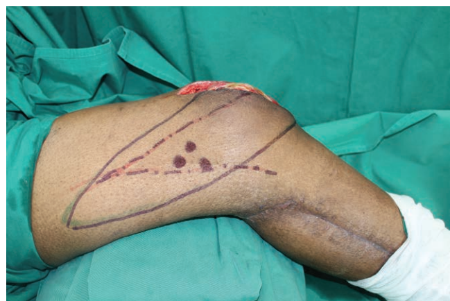
Fig. 1. Marked perforators and V-Y skin paddle design for anterior knee defect.

With the reintroduction of fasciocutaneous flaps by Pontén in 1981 and subsequent perforator vascular studies