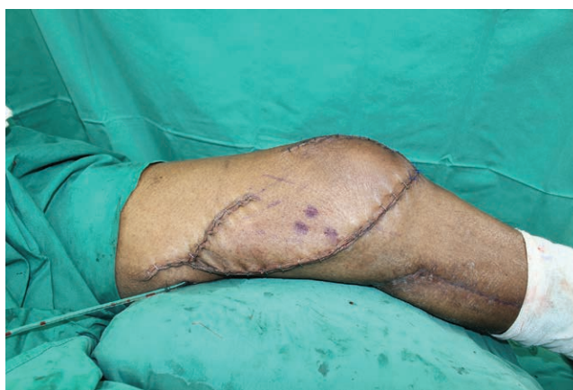
Fig. 3. Flap inset and closure.

by Nakajima et al, a new paradigm in flap selection protocols emerged for lower extremity reconstruction. 7 Furthermore, the concept of free-style flaps by Wei and Mardini 8 has been extrapolated to applications in perforator flap harvest in the upper medial thigh, 9 termed “upper medial thigh perforator flap” to reflect the heterogeneity of perforators in this region. Similarly, the angiosomes over the lower medial thigh are highly variable, and a free-style approach to raising flaps in this region would likewise be applicable.