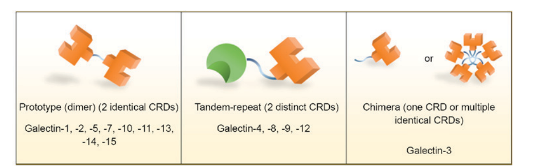
Figure 1. Classification of galectins into prototypical (dimeric), tandem-repeat and chimeric galectins. Prototypical (dimeric) galectins possess two identical CRDs. Tandem-repeat galectins possess two distinct CRDs. Chimeric galectins possess a single CRD, and may aggregate to form its common appearance with multiple identical CRDs. CRD, carbohydrate-recognition domains.

expression level and cancer prognosis. Irrespective of the cancer type, increased expression of galectin-1 is generally associated with poor overall and disease-free survival rates (7). By contrast, studies of galectin-3 for the prediction of cancer prognosis revealed various results, mostly depending on the cancer types. Increased expression of galectin-3 in brain cancer (32), acute myeloid leukemia (33) and colorectal cancer (34) is associated with poorer overall survival times and rates, while increased expression of galectin-3 is associated with improved survival rate in gastric cancer (19). In addition to predicting cancer prognosis, the levels of galectins are also associated with the stages and grades in different cancer types. A positive correlation between the expression level of galectin-1 and cancer stage has been observed in gastric cancer (35), ovarian cancer (36) and chronic lymphocytic leukemia (37). In colon cancer, the expression of galectin-3 has proven to be correlated with the stage of colon cancer (38). A positive correlation between the expression of galectin-3 and tumor grade has also been reported (39).