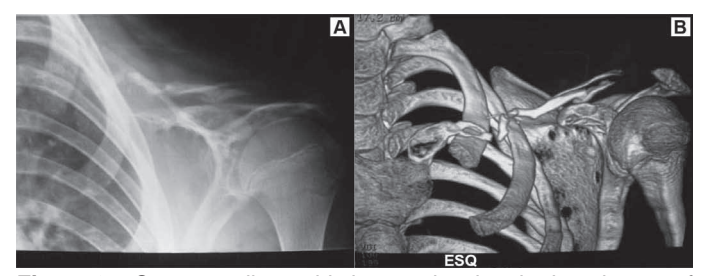
Figure 2 – Current radiographic image showing the impairment of the scapula with foci of osteolysis (A). Axial computed tomography scan with 3D digital reconstruction, showing intense osteolysis in the left clavicle and foci of associated impairment of the scapula (B).

The follow-up was continued for three years until, in 2008, at the age of 12 years, the radiological evaluation showed that the pattern of osteolysis of the clavicle had stabilized, although the radiographs showed lesions in the upper part of the left scapula. ACT and MRI confirmed the presence of osteolytic lesions in the scapula as far as the glenoid mass, coracoid and acromion