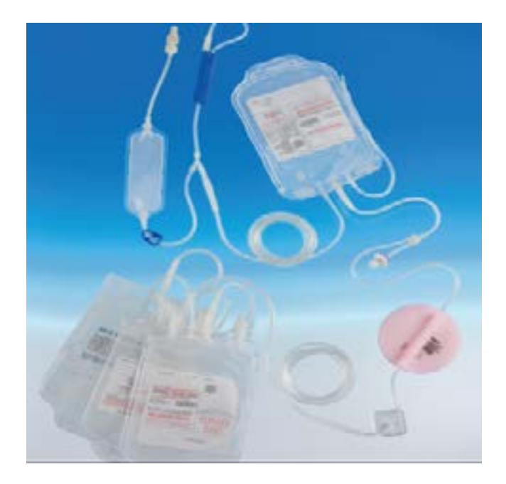
Figure 1: Leukotrap® WB blood bag from Haemonetics®

To ascertain that the process of leucocyte-filtration was successful, we performed quality control tests on 55 random blood units, between 14th February 2014 and 15th May 2015. At the bed-side; prior to the transfusion of the individual units used for quality control tests, 2mls of blood each were sampled from a sub-set of 55 LR RBCs units using a sample-site coupler, and complete blood count (CBC) were done using the Sysmex automated haemaology analyzer (XN-20, Sysmex Corporation, Kobe, Japan), to determine the residual leucocyte count. We defined a failed filtration as a blood unit that failed to start filtration within five minutes of being suspended and /or would filter very slowly (for >30 minutes) and incompletely. We regarded a residual leucocyte count above 11•1 WBC/uL (equivalent to >5x106 WBCs per unit) for successfully filtered units as not meeting international standards for LR.