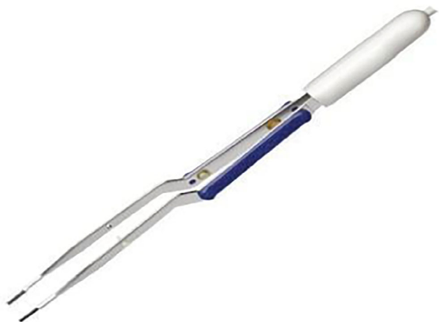
FIGURE 1 ENTceps (Microline Surgical, Beverly, Massachusetts)

A variety of surgical instruments and technologies are available for tonsillectomy. With each technology there is a varying degree of aerosolization. 6 Among them, a novel bayonet-style thermal welding device (TWD) (ENTceps; Microline Surgical, Beverly, Massachusetts; Figure 1) utilizes pressure and heat to generate a temperature gradient. This allows the device to cut tissue between the forceps and coagulate mucosa peripherally to form a seal. 7 In the context of SARS-CoV-2 and the introduction of this new technology, we set out to explore this instrument and its potential in reducing aerosolization in tonsillectomy.