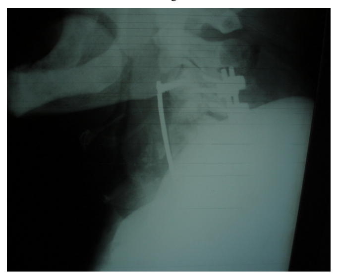
Fig. (12). Lateral cervical spine X-Ray showing revision of the anterior fusion with replacement of displaced screws, and posterior fusion with screws, rods and allograft from C3 to C7.

anterior approach due to anterior compression, with one of the two requiring supplemental posterior fixation because of hardware failure and pseudarthrosis [9]. Of note, because of