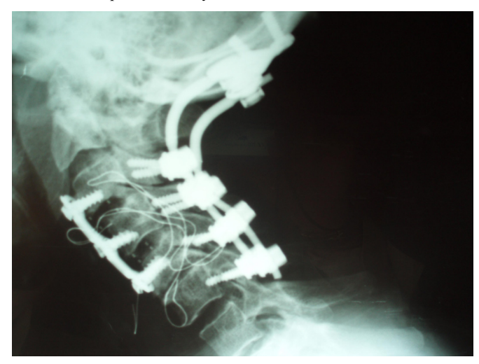
Fig. (7). Lateral cervical spine X-Ray showing posterior craniocervical stabilization and fusion with occipital and lateral mass screws, rods and allograft.

distribution) for 2 months. Neurologic examination demonstrated bilateral deltoid and biceps muscle weakness, but no other abnormal findings. Laboratory evaluation showed elevated urea and serum creatinine levels, consistent with end-stage renal disease. Plain cervical spine films and computed tomography revealed partial destruction of the C3 and extensive destruction of the C4 and C5 vertebral bodies (Figs. 8 , 9 ). MRI scan demonstrated mild compression of the anterior subarachnoid space and impingement of the C5-C6 roots, but no spinal cord abnormalities.