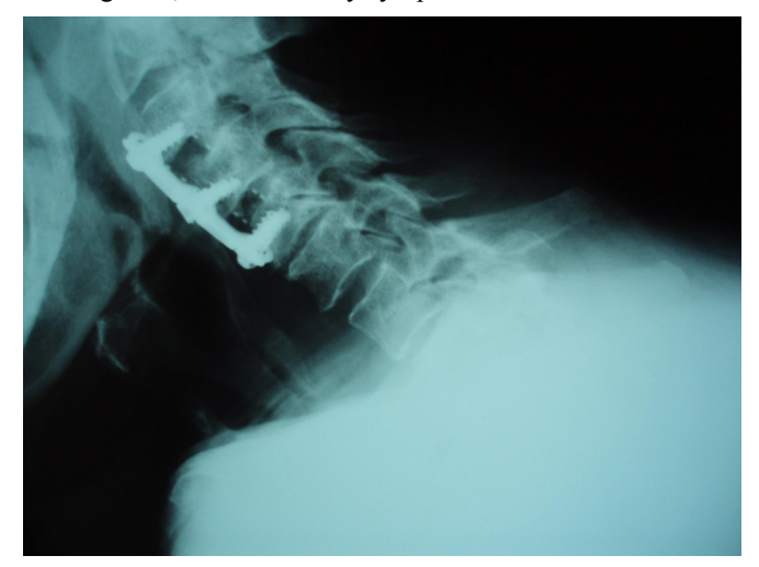
Fig. (5). Lateral cervical spine flexion X-Ray, which, in conjunction with extension X-Ray (Fig. 6) reveals hardware failure with cervical spine instability.

significantly. However, 14 months later he returned to the Outpatient Clinic with recurrence of neck pain and gait disturbance over a 2-month period. Although repeat cervical spine MRI scan did not reveal any abnormal findings, lateral cervical spine flexion-extension radiographs revealed hardware failure with cervical spine instability (Figs. 5, 6). Based on these findings, the patient underwent supplemental posterior cranio-cervical stabilization and fusion with occipital and lateral mass screws, rods and allograft (Fig. 7). Postoperatively, the patient experienced immediate symptom improvement, and was discharged home on postoperative day 4. Two years later, the fusion remains stable; the patient is doing well, and denies any symptom recurrence.