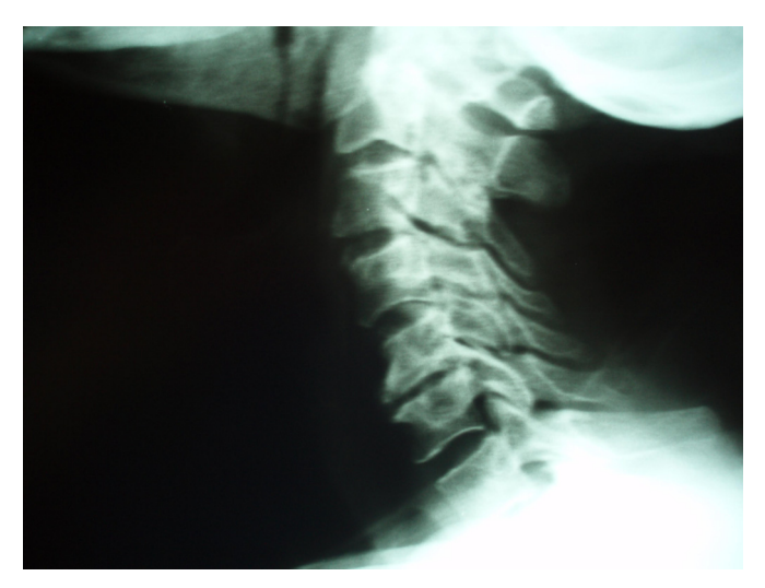
Fig. (1). Lateral cervical spine extension X-Ray showing spondyloarthropathy with vertebral body degeneration, C3-C4 and C4-C5 instability and spurs.