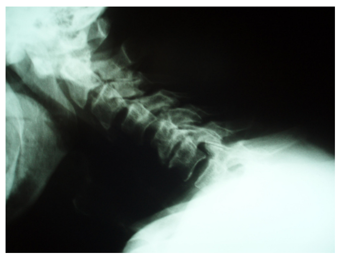
Fig. (2). Lateral cervical spine flexion X-Ray showing spondyloarthropathy with vertebral body degeneration, C3-C4 and C4-C5 instability and spurs.