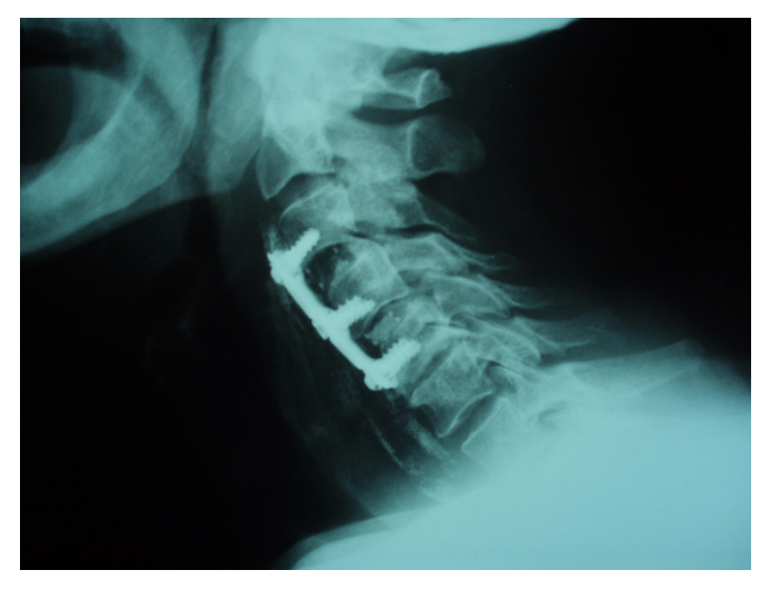
Fig. (4). Lateral cervical spine X-Ray showing anterior cervical discectomy and fusion at C3-C4, C4-C5 using PEEK allograft, and anterior fixation with dynamic plate and screws from C3 to C5.

significantly. However, 14 months later he returned to the Outpatient Clinic with recurrence of neck pain and gait disturbance over a 2-month period. Although repeat cervical spine MRI scan did not reveal any abnormal findings, lateral cervical spine flexion-extension radiographs revealed hardware failure with cervical spine instability (Figs. 5, 6). Based on these findings, the patient underwent supplemental posterior cranio-cervical stabilization and fusion with occipital and lateral mass screws, rods and allograft (Fig. 7). Postoperatively, the patient experienced immediate symptom improvement, and was discharged home on postoperative day 4. Two years later, the fusion remains stable; the patient is doing well, and denies any symptom recurrence.