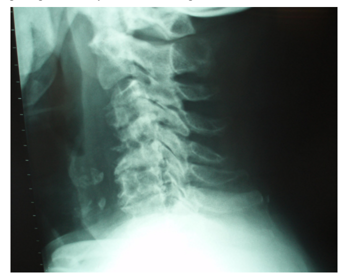
Fig. (8). Cervical spine lateral X-Ray showing partial destruction of the C3 and extensive destruction of the C4 and C5 vertebral bodies.

The patient then underwent repeat cervical spine surgery, which consisted of anterior fusion revision with replacement of the displaced screws and autograft, combined with supplementary posterior fixation and fusion using lateral mass screws from C3 to C7, rods and allograft (Fig. 12). Postoperatively, the patient experienced complete resolution of neck and arm pain and moderate improvement of upper extremities weakness. He was discharged home on postoperative day 7, and remains pain-free after 14 months.