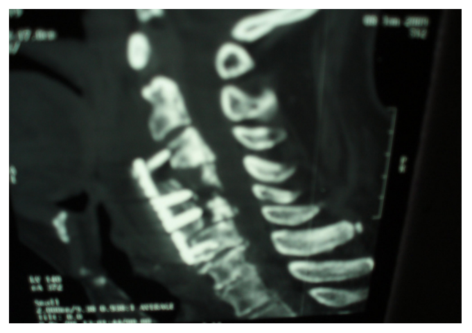
Fig. (11). Postoperative cervical spine CT showing hardware failure at C3 with anterior shift of the allograft.