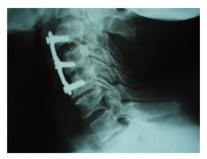
Fig. (6). Lateral cervical spine extension X-Ray, which, in conjunction with flexion X-Ray (Fig. 5) reveals hardware failure with cervical spine instability.