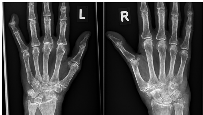
Figure 3 X-ray of the left hand of a 68 year old patient with CPPD which shows CC in the 3rd MCP joint and OA in the 2nd and 3rd MCP joint. X-ray of the right hand of a 75 year old patient which shows CC in ulnocarpal joint and severe STT OA.

CC in at least one of the examined joints was detected in 90.1% of patients with CPPD only. A typical example is shown in figure 3 . The prevalence of CC was different in seronegative (32.3%) versus seropositive (16.6%) RA ( p<0.001 ). In patients with CPPD plus RA, CC was detected in all cases. CC was most frequently detected in wrists: in 74.0% of patients with CPPD only and in 81.1% of patients with both, CPPD and RA. The prevalence of CC in knees could not be exactly determined, because only about 60% of symptomatic patients had undergone conventional radiography of these joints at the time of presentation. Nevertheless, CC was found second most frequently in knees: in 42.7% of patients with CPPD and in 45.3% of those with CPPD and RA. A total of 75 patients with only CPPD and 33 patients with CPPD and RA had a full set of X-rays (hand, wrist, knee and feet). In these patients with CPPD only, 56 had CC in the knees (74.7%), and 54 had CC in the wrists (72.0%).