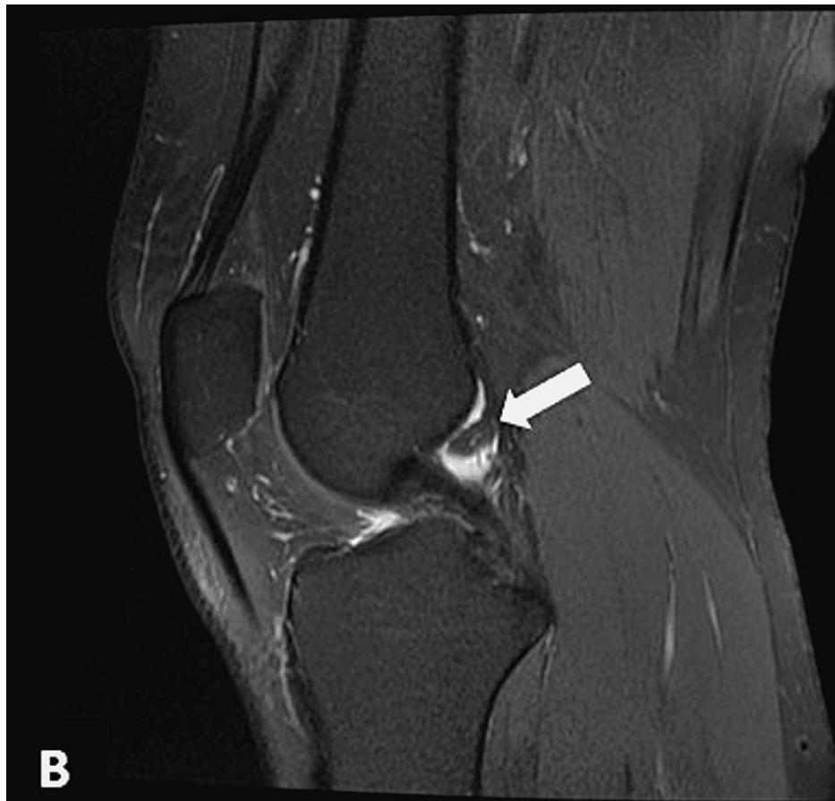
FIGURE 6: Sagittal PDFS sequences revealing suppression of intra-articular signals suggestive of lipoma