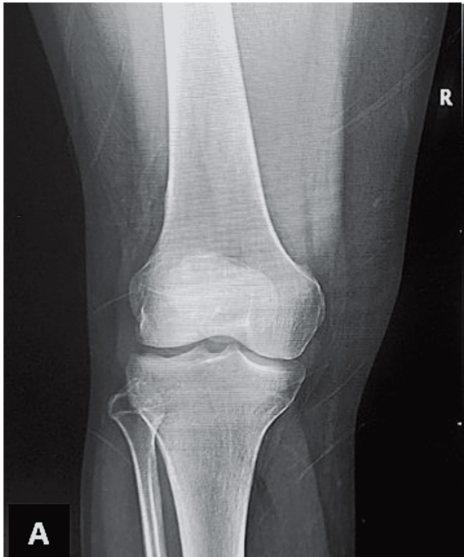
FIGURE 2: Normal A/P view X-ray of the knee showing no soft-tissue swelling or osteodegenerative changes