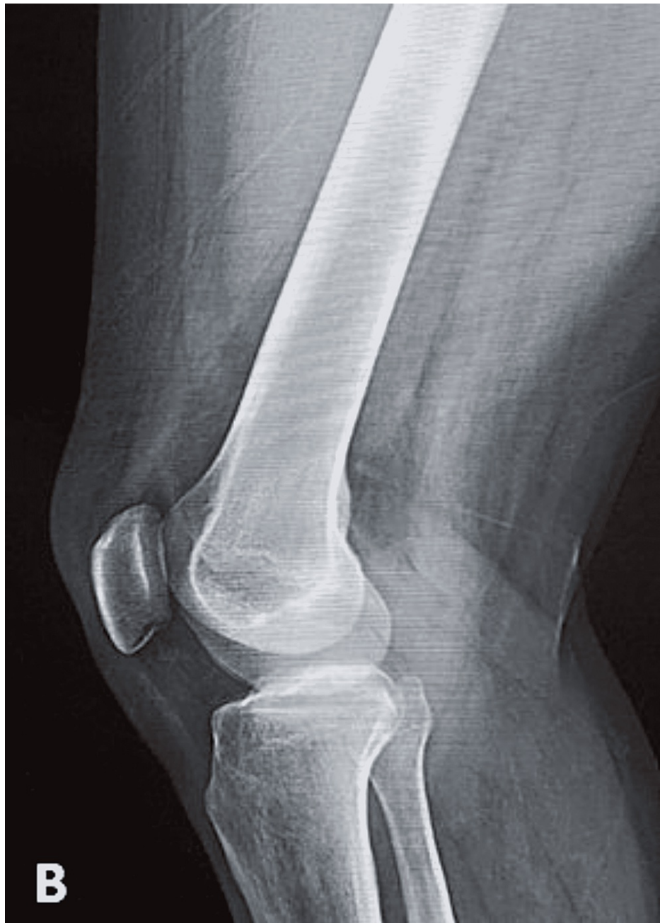
FIGURE 1: Normal (B) lateral view X-ray of the knee showing no soft-tissue swelling or osteodegenerative changes