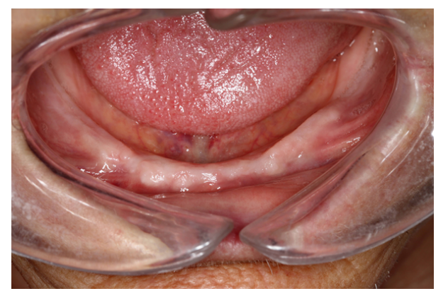
Figure 1: Intraoral illustration of lower jaw with absence of any dehiscence

treated with decortin. While intraorally no dehiscence was detected (Figure 1), a panoramic view indicated irregular bone morphology especially in anterior mandible (Figure 2) compared to preoperative imaging 10 months ago (Figure 3). A CT scan illustrated the whole extent (Figure 4). A RANK-Ligand inhibitor (denosumab) associated osteonecrosis of the mandible was diagnosed and reminded us of known BP effects on the jaw. Due to missing dehiscence she was treated conservatively with sultamicillin and prosthesis leave for 2 months with slight improvement of complaints. On the other hand with respect to the great extent of the osteonecrosis, we clarified the potential need of microvascular free flap for reconstruction.