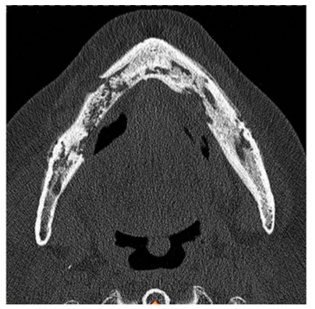
Figure 4: Finally CT scan showed up whole extent of osteonecrosis