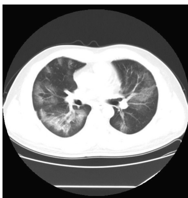
Fig. 1. Chest CT, February 13,2020 (Illness Day 19, Hospital Day 16). Multiple ground-glass opacification in both lungs, more than 75% of the lungs were involved.

The next afternoon, the patient had cyanosis and a cough with bloody sputum. The respiratory rate was 36 breaths/minute and oxygen saturation was 95% with high-flow oxygen. The patient was started on noninvasive positive pressure ventilation [positive end-expiratory pressure (PEEP) was setting 5 cm H 2 O; fraction of inspiration (FiO 2 ) was 70%] under morphine sedation. The chief physician changed medication from sulperazone to meropenem. The laboratory results (after 1 hour) showed ongoing leukocytosis, lymphopenia and an increase in neutrophils, liver enzymes, myocardial enzymes, and a decrease in oxygen partial pressure for the first time ( Table 1 ). At this point, the ratio of the partial pressure of arterial oxygen (PaO 2 ) to FiO 2 (PaO 2 :FiO 2 ) < 100 mmHg indicated that severe ARDS had occurred ( World health organization, 2020 ). Chest radiograph showed enlargement of cardiac shadow ( Fig. 2 ). As the condition deteriorated, the patient underwent endotracheal intubation via electronic bronchoscope adaptive pressure mode (parameters: respiratory frequency of 20