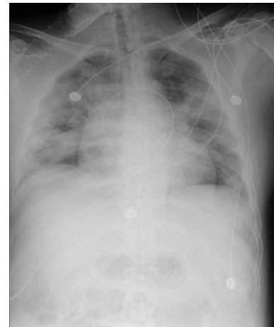
Fig. 2. Posteroanterior Chest Radiograph, February 14,2020 (Illness Day 20, Hospital Day 17). The shadow of the heart was enlarged and full.

times per minute; tidal volume of 420 ml; PEEP of 10 cmH 2 O; FiO 2 of 85%). After intubation, the patient's ventilation pattern was smooth, with no obvious patient-ventilator dyssynchrony.