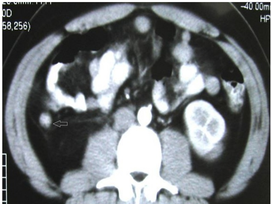
FIGURE 1: Acute appendicitis in a 21-year-old male. Axial contrast enhanced image showing dilated appendix measuring 11 mm (Arrow) in maximum thickness with enhancement of its walls.

Appreciation of a thickened/distended appendix which is >6 mm whether it is with or without mural thickening and enhancement (Figure 1).