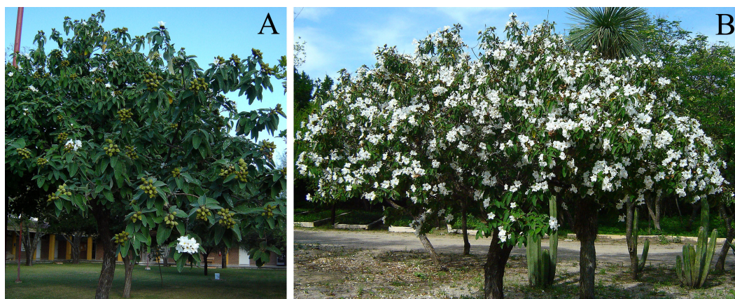
Figure 1 Examples of Cordia boissieri plants with distinct flower cover. Plant without or with very few flowers (A) and plant with high numbers of flowers (B). Only those with high dense flower cover were considered as flowering.

( Gilman & Watson, 1993 ; Alvarado et al., 2004 ). In addition, the anthers are oblong, filiform, glabrous, and yellow–greenish; the pistil usually varies in length and narrows towards the apex, ending with two stigmas. Flowering occurs throughout the year, with peaks in the rainy season from late spring to early summer ( Vines, 1986 ; Gilman & Watson, 1993 ; Alvarado et al., 2004 ).