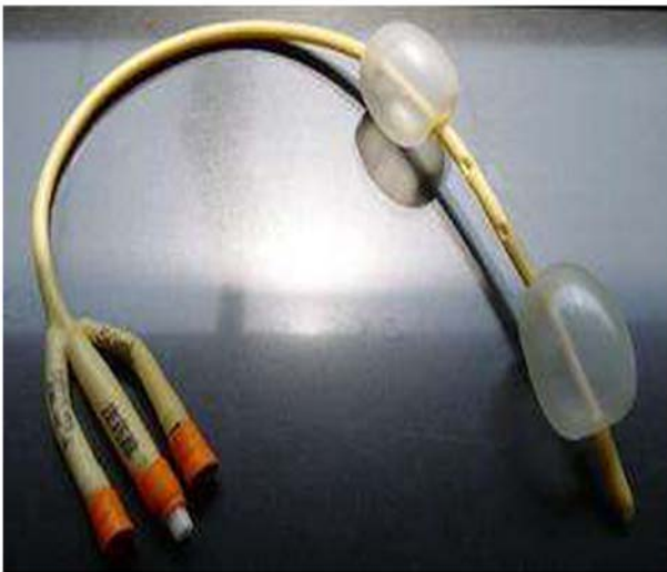
Figure 3. The abdominal drainage tubes with balloons. The internal diameter and length of the tube was 7.3 mm and 39 cm, respectively.

Recipient 2 was diagnosed with avascular necrosis of the liver and the following measures were taken: Withdrawal or reduction of the dosages of the drugs considered to have caused the liver damage, adjustment of the dosage of the immunosuppressive agents, increasing the administration of antibacterial drugs and initiation of somatostatin and terlipressin to improve the blood supply to the liver. Thereafter, the clinical symptoms of recipient 2 improved significantly on the 13th postoperative day. He experienced a gradual recovery of his liver function and was then discharged from hospital. As of now, recipient 2 remains in remission and is subjected to regular follow-ups.