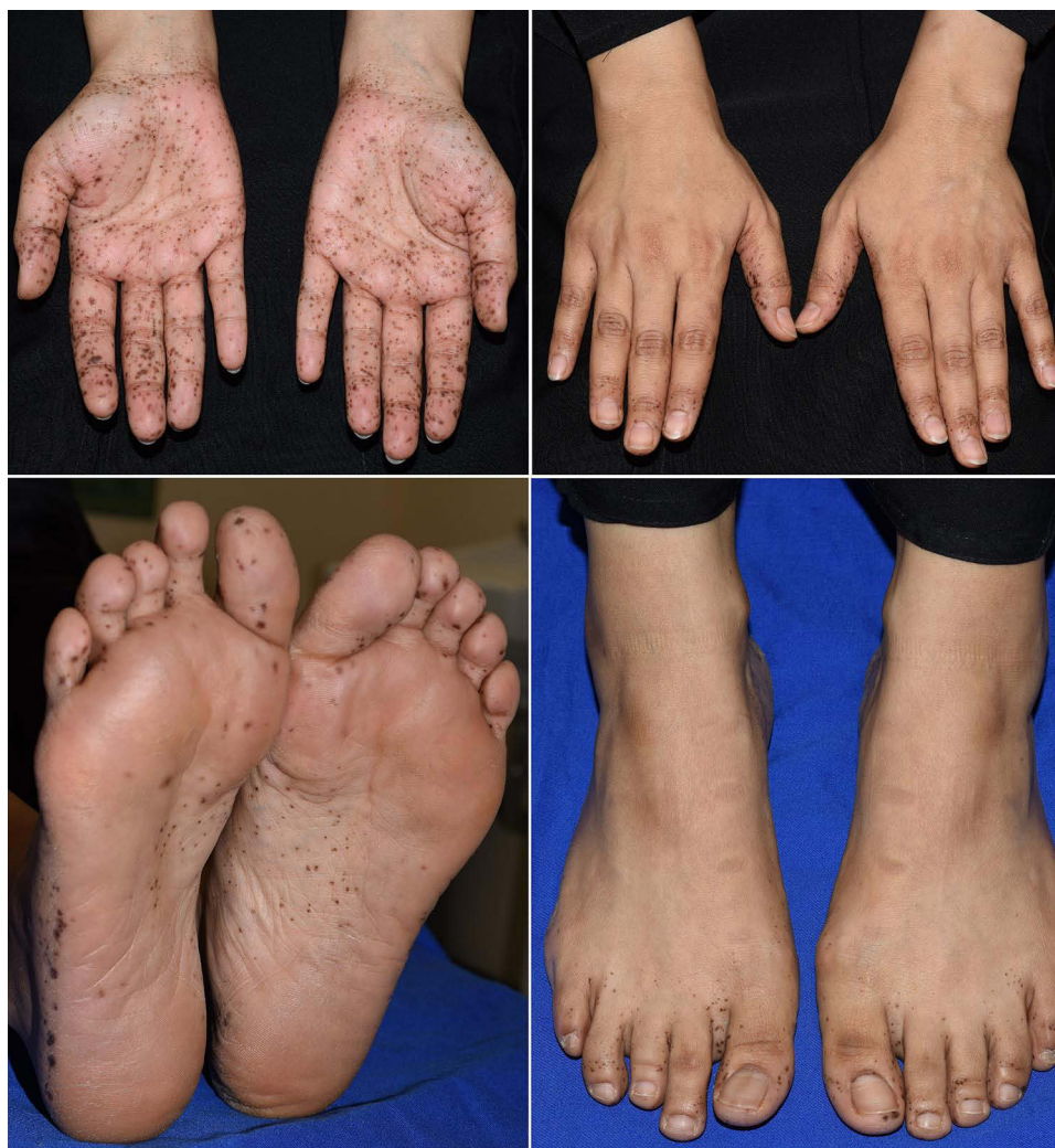
Figure 1 Clinical images showing numerous macules with different shades of brown affecting mainly the palmoplantar surfaces with some extension to the periungual areas.