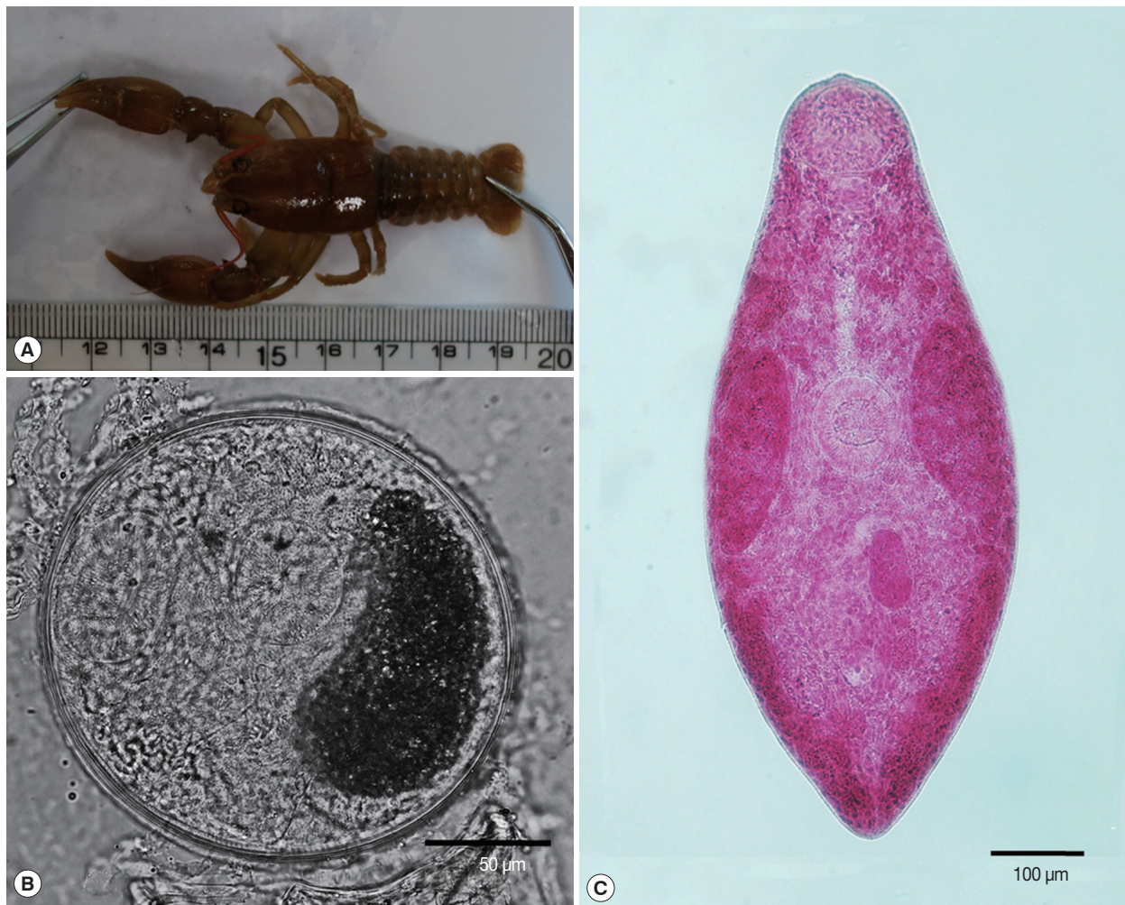
Fig. 1. Morphological findings of Macroorchis spinulosus in this study. (A) Crayfish caught from Isipgokri, Hwasun-eup, Hwasun-gun, Jeollanam-do Province, Korea. (B) M. spinulosus metacercaria, which is round, 180 µm in average diameter, and encysted with 2 layers of thick walls. However, the stylet on the oral sucker is not distinct in this figure. (C) Adult worm of M. spinulosus showing its oval shape, 760-820 µm length and 320-450 µm width, and anterolateral location of 2 large testes (acetocarmine stain).

Semichon's acetocarmine. Both fresh and stained specimens were observed under light microscopy.