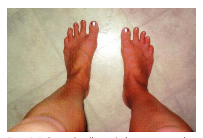
FIGURE 1. Redness and swelling in the lower extremities of our patient with erythromelalgia.

The initial MT assessment showed limited active and passive range of motion of the extremities because of hypertonicity in the muscles. The patient monitored her pain and discomfort using a pain scale of 0 - 10 (0 = no pain, 10 = extreme pain)<sup>(8)</sup>. On initial assessment, the patient reported pain in the distal extremities as 8 bilaterally. She indicated experiencing more pain in the evening, peaking at night before bed, and she described experiencing painful symptoms of erythromelalgia approximately 3-4 days each week, with episodes lasting between 24 and 72 hours. She described the characteristics of the pain in the lower extremities as a cramping pressure, and she provided a photograph of the distal extremities showing redness and swelling as a result of erythromelalgia (Figure 1). Aggravating factors for the patient included extreme