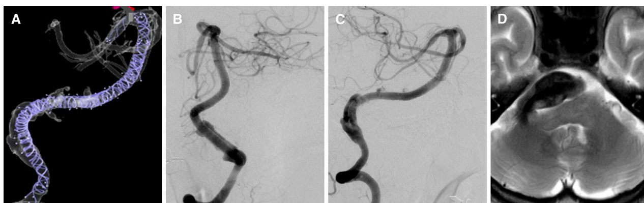
Fig. 2 (A) Cone beam CT confirming that the overlapping stents were placed from the tip of the right posterior artery to the right vertebral artery. (B and C) Six months after surgery, DSA showed