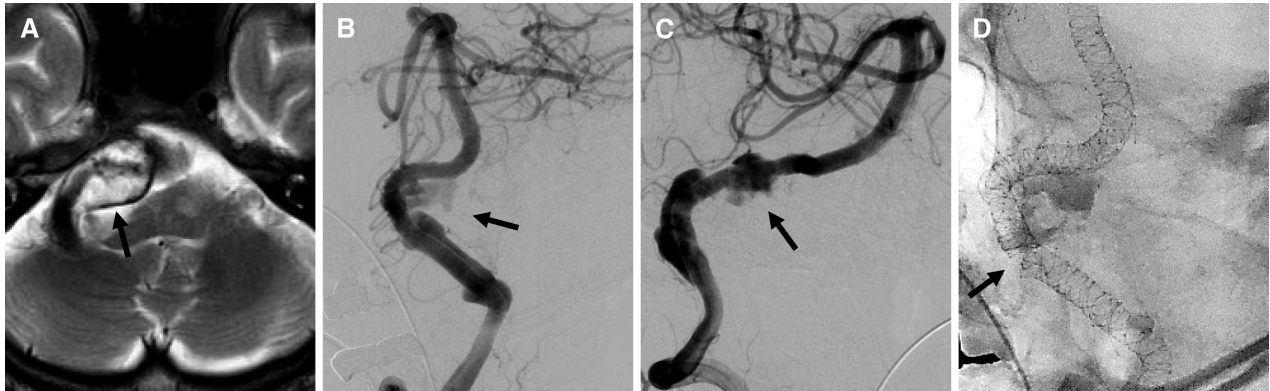
Fig. 3 (A) One year and seven months after surgery, MRI showed a change in signal intensity in the thrombosed aneurysm (arrow). (B–D) DSA showing that the vessel had become more tortuous, with

findings of inadequately overlapping stents and leakage of contrast outside the stent (arrows).