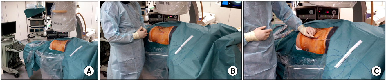
Fig. 2. Standard prone (A), tilted prone (B), and tilted prone (C) with hand assistance.

step' tract dilation, with a 16.5/19.5 Fr metal access sheath, is performed (Karl Storz, Tuttlingen, Germany). A rigid nephroscopy is conducted with a rigid 12-Fr nephroscope (Karl Storz). After identification of the stone, according to the group assignment, the patient was operated in either standard prone (Fig. 2A) or tilted prone position (Fig. 2B), with the maximum intention to bring access sheath to horizontal. Gentle hand assistance was applied to maximize tilting if needed (Fig. 2C). Fragmentation of the stone mass instead of “laser painting” with the formation of fitting the access sheath particles, which were immediately evacuated via Bernoulli effect, was accomplished with laser lithotripter (VersaPulse 100 W, Lumenis, Israel) and 365 micron laser fiber, under the following initial parameters: 0.5 J and 20 Hz. Nor basket neither grasping device was needed during all operations. Nephrostomy/stent or totally tubeless ending was at the surgeons' discretion. Blood cell count and creatinine level were analyzed on the first postoperative day. Evaluated parameters in the study were nephroscopy time i.e., time from stone identification till the end of the evacuation of the last fragment, stone free and complication rates.