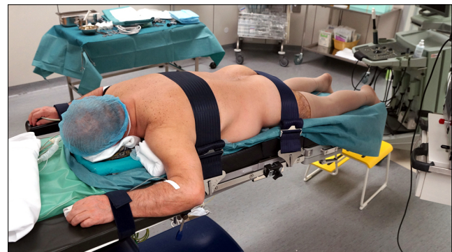
Fig. 1. Patient prone strapped to the operating table.

We obtained Institutional Review Board approval to perform a single center prospective, randomized and controlled study (approval number: ΓHK - 72345). All patients undergoing mini-PCNL procedure between February 2015 and April 2016 for solitary medium-sized kidney stones (1–2 cm) of high density (more than 1,000 HU) were consented to be included in the study. Choice of treatment modality was dictated by existing guidelines [6] and local insurance coverage protocols. Randomization was performed via a web-based generator of true random numbers, in which the