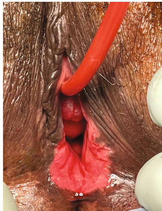
FIGURE 3: Suspected tumor at the vaginal opening and a suspected tumor covering the urethral meatus.

HIV [9]. During acute infection, CD4 and CD8 cells infiltrate the epidermis and the dermis of the ulcer site to eliminate the HSV-2 virus particle. The average number of cells present at the ulcer site for CD4 and CD8 is 655 and 618,