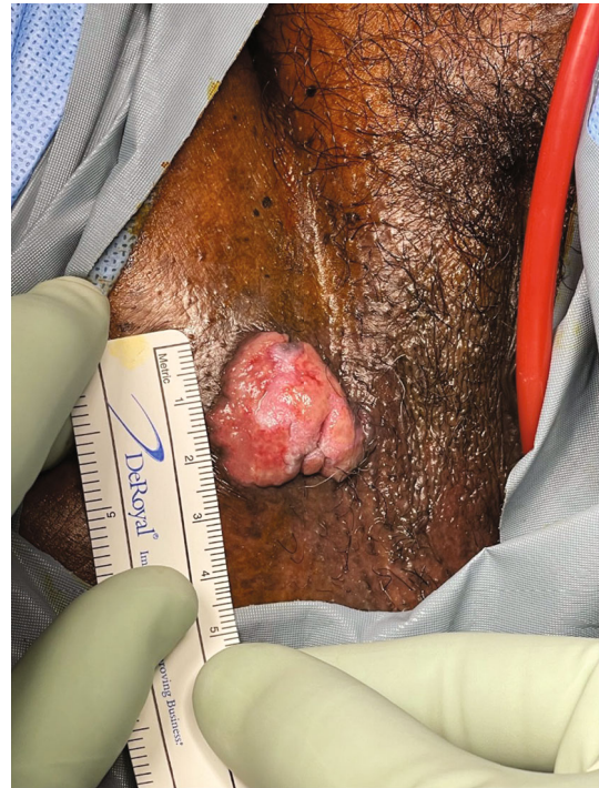
FIGURE 2: Raised fungating mass within the right inferior vulva measuring approximately 4 cm × 3 cm.

Further investigation shows that healed lesions from HSV-2 infections also present an increased risk of acquiring