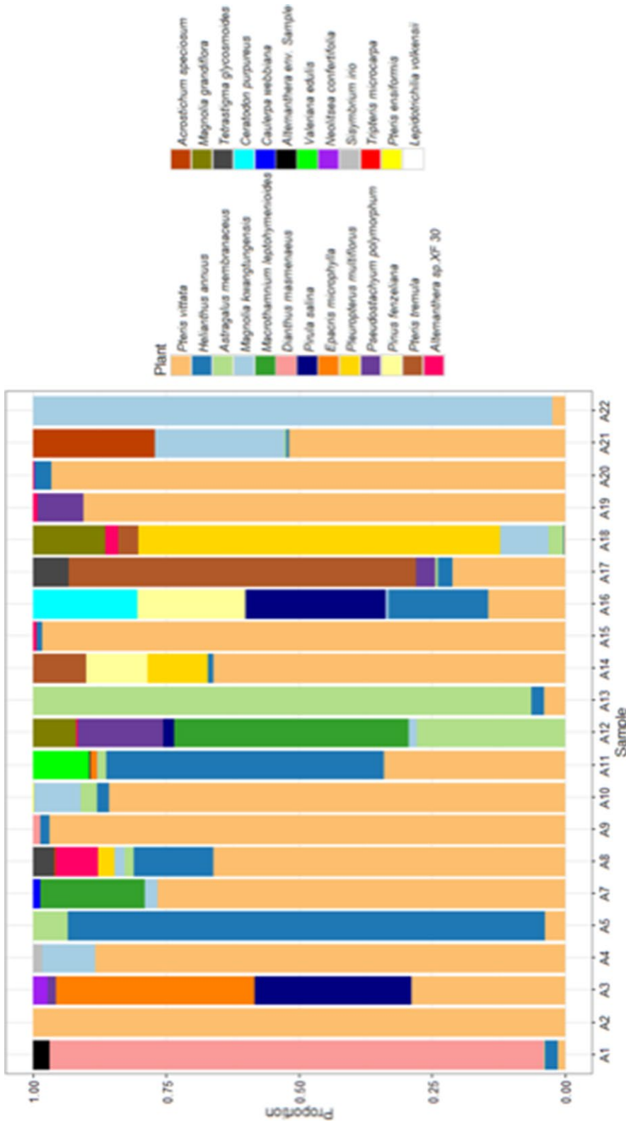
FIGURE 2 Bar graph representing 22 samples classified with the ITS2 database. The different colours indicate different plant species identified with the sequence database, and in which percentage it was detected in each sample

were identified. A summary of all plant species identified and associated abundance can be seen in Figure 2. However, several sequence reads could not be classified confidently to species level with the ITS2 database. Eight taxa could only be classified to genus level, five to family, two to class and another one to order. Of the eight genera identified, three correspond to prior