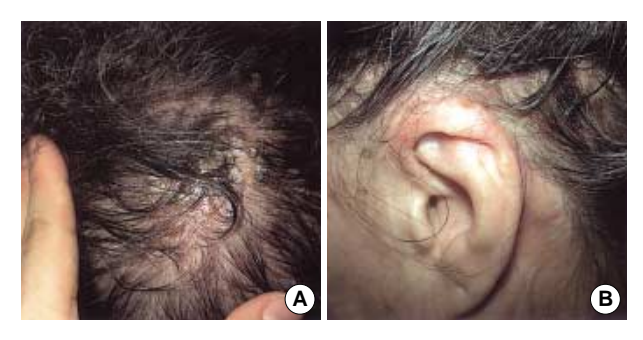
Fig. 1. Erythematous papules with crusts and erosions on the left scalp and left ear lobe.