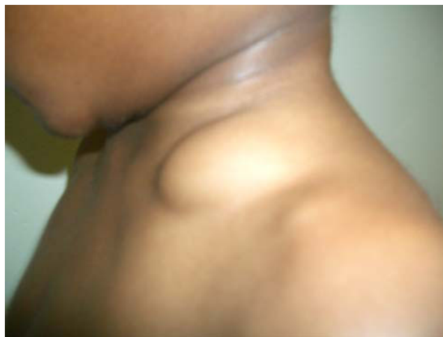
Figure 1 Photographs of the child at age 5, showing massive lymphadenopathy.

Subsequently, his medical history has been complicated by repeated admissions for infections and vaso-occlusive crises and the need for chronic blood transfusion for three years. This in turn led to iron overload due to non-compliance with chelation therapy and so the blood transfusions were stopped. In addition shortly after the second presentation with massive lymphadenopathy, he developed