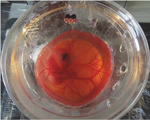
Fig. 1. Chicken embryo on day 11 of culture, based on the method of Tahara and Obara (2014).

use rice bowls as culture vessels to observe the early development of chicken embryos (Motokawa et al. , 2008). These approaches have also been demonstrated in class. However, these approaches have not achieved embryo hatching.