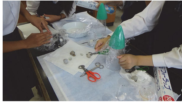
Fig. 2. Biology laboratory class at high school using quail eggs.

Students who wish to participate are asked to raise the chicks after the shell-less culture experiments in their own homes. However, in urban areas, the number of households that can raise chickens is limited due to various factors such as the surrounding environment. Therefore, Tahara examined the conditions to determine whether the chicken shell-less culture approach can be applied to quail, which are easier