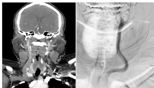
Figure 1 Left common carotid macrothrombosis on CT angiography and left carotid injection on digital subtraction angiography.