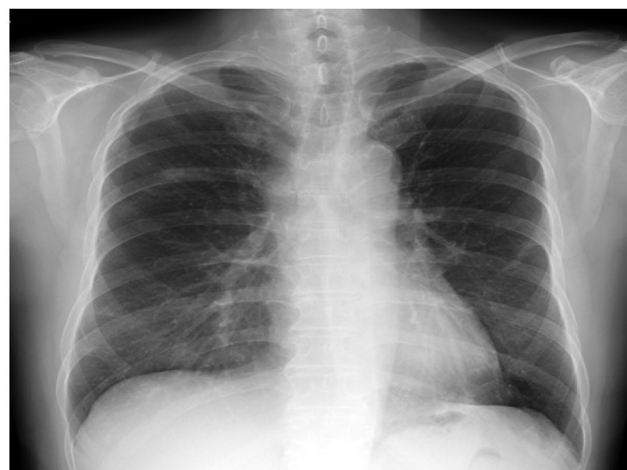
Figure 1 Chest X-ray at the onset of pneumonitis.

Note: Chest X-ray did not show major abnormal shadows.