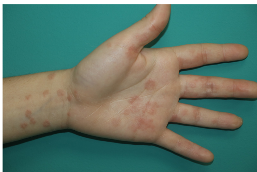
Figure 4 Nonspecific rash, with perfollicular distribution in a patient with COVID-19.