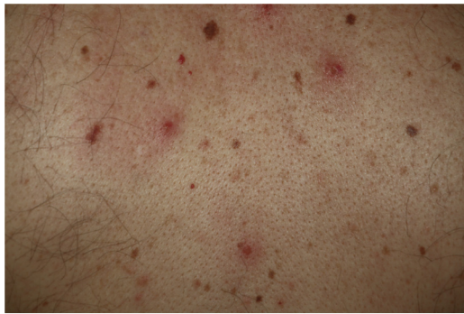
Figure 2 Disperse monomorphic papulovesicles on the trunk.