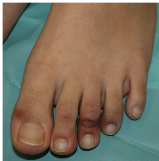
Figure 1 Acral pseudochilblain papule.

The acral pseudochilblain pattern of lesions, reported by Galván et al. 11 as acral, erythematous, and edematous lesions, with formation of vesicles and pustules, are perhaps the most characteristic skin lesions associated with the SARS-CoV-2 pandemic. The description and reporting