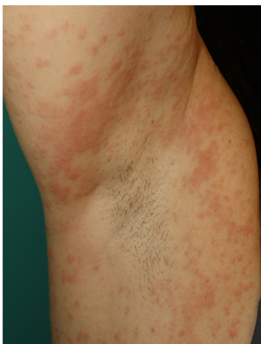
Figure 5 Multiform erythema-like eruption in a patient with SARS-CoV-2 infection.

or with macules or more extensive areas with a purpuric appearance. In other cases, the lesions have a markedly perfollicular distribution (Fig. 4) with variable degrees of scaling, some of which have been reported as similar to pityriasis rosea. 25 Infiltrated papules have also been observed; these are pseudovesicular lesions or similar to erythema elevatum diutinum or multiform erythema, and they may occasionally be pruritic (Fig. 5). 26 A markedly craniocaudal development has also been reported, with involvement of the folds but without the palmoplantar region or the mucosa being affected. 27,28