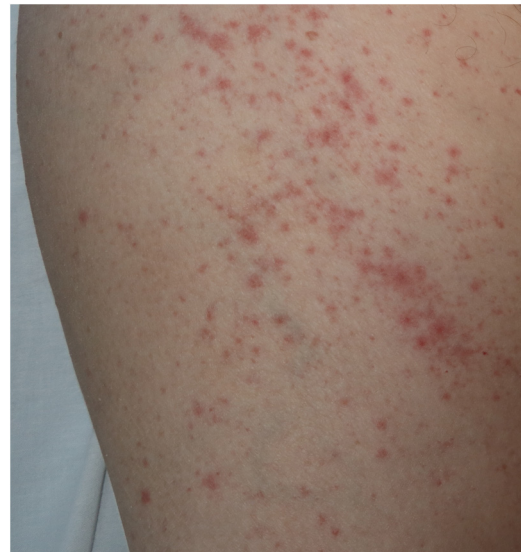
Figure 3 Maculopapular rash in a patient with COVID-19 associated with bilateral pneumonia, who received different drugs. Differential diagnosis with respect to toxicoderma is difficult.

Henry et al. 21 reported the case of a female patient who developed an urticarial rash, accompanied byodynophagia and arthralgia, before developing the full clinical manifestations of COVID-19. Van Damme et al. 22 reported a further 2 cases of urticarial rash as the first clinical manifestation of COVID-19, although microbiological confirmation of infection was only obtained in 1 of those, and in both cases the