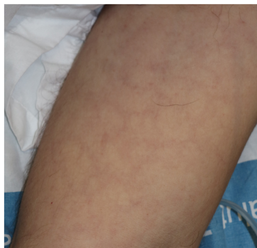
Figure 7 Livedoid rash with a transient course on the trunk of a patient with severe COVID-19.

flexural exanthema (SDRIFE), possibly associated with viral infection, given that the rash resolved despite continued use of the drug. 30 We have also observed a similar distribution in our own patients (Fig. 6). From the histological point of view, a range of features have been reported within the group of maculopapular rashes, such as a perivascular inflammatory infiltrate with discrete lymphocytic exocytosis, marked vessel dilatation in the superficial and medial dermis, as well as lymphocytic vasculitis. 31,32