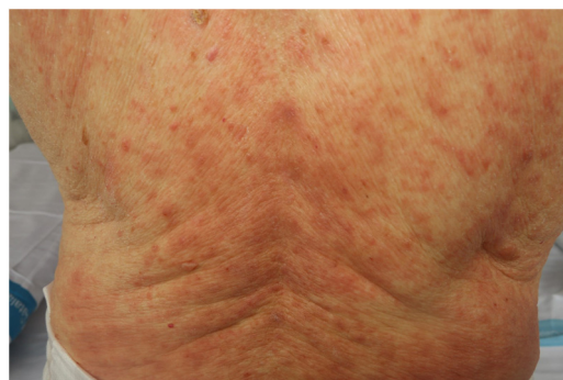
Figure 6 Periaxillary exanthematous eruption similar to SDRIFE.

Jimenez-Cauhe et al. 29 reported the case of a female patient who developed a coalescent erythematous-purpuric rash about a millimeter in size, with a flexural distribution predominantly in the periaxillary region. The authors considered the difficulty of associating the skin manifestations with viral infection in view of its nonspecific appearance and concomitant medication use. Other authors have reported the appearance of rash that resembles the typical skin involvement of symmetrical drug-related intertriginous and