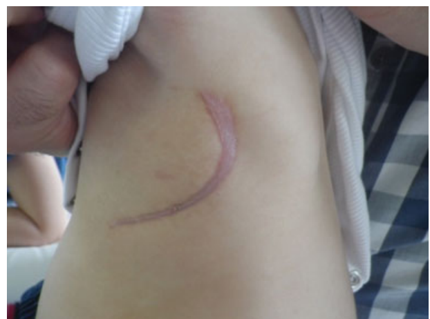
Fig. 4 Clinical presentation after 2 months.