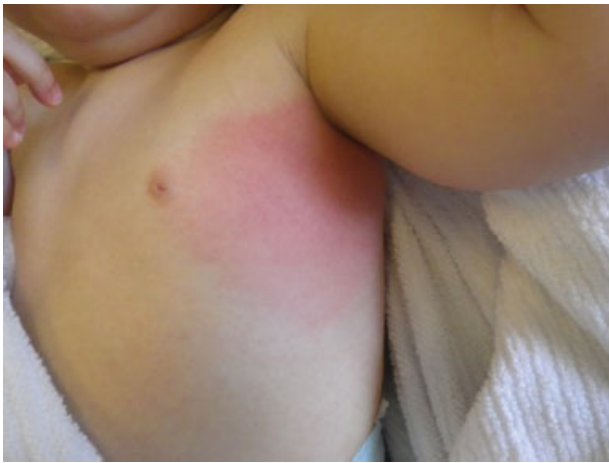
Fig. 1 Initial clinical demonstration leading to the diagnosis.