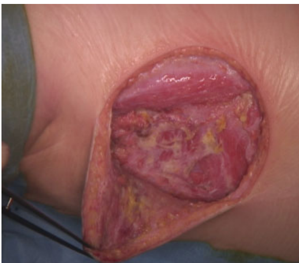
Fig. 2 Intraoperative site after incision.

NF is a rapidly progressing and potentially life-threatening infection of the superficial fascia and subcutaneous tissue. Early diagnosis is essential because immediate surgical debridement offers the best chance for survival. It has been reported that delay of surgical intervention by more than 24 hours doubles mortality. 3 Initial symptoms are nonspecific: the most frequently reported signs are fever, tenderness, erythema, and pain. 2 Since the underlying tissue is affected more extensively than the dermal or epidermal layer, edema may extend the erythematous border. The often fulminant progression of skin findings occurs within hours and erythema progresses to violaceous necrotic lesions, vesicles, and bullae if untreated. 3