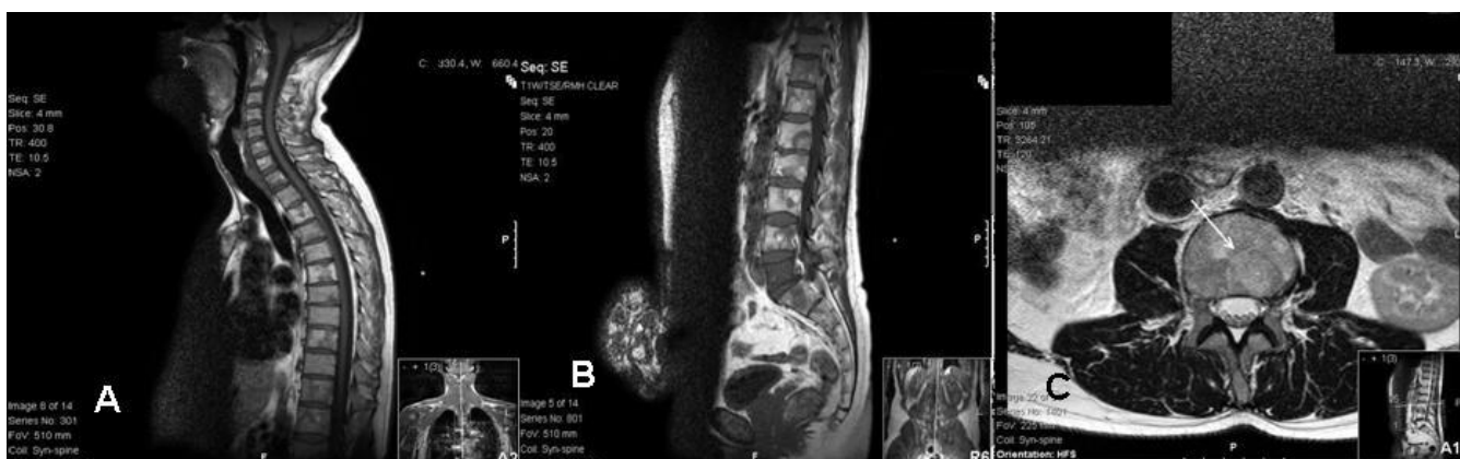
Figure 3 Diffuse abnormal bone marrow signal throughout the spine. Note multiple lesions with high-signal centres on T1W, reflecting the myxoid/fatty nature of the deposits. (a) Sagittal T1W MR image of cervical and thoracic spines. (b) Sagittal T1W MR image of lumbosacral spine. (c) Transverse section T2W MR image in L3.

our patient was initially asymptomatic, there was no way to detect the metastatic bone lesions and no reason to suspect they were present, and this may explain the late diagnosis. We do not know when skeletal lesions first occurred, as no spinal MRI was obtained between initial diagnosis and 2005. In addition, all other surveillance imaging investigations were negative. Ishii et al. [6] have reported two cases of relatively early bone metastases (2 and 4 years latency) not detected by bone scans. They attributed the normal accumulation of radiotracers to the likely diminished metabolic bone activity. Other authors have suggested that the myxoid stroma may prevent labelled glucose from reaching cells in sufficient quantity to be detected by the scanner [8].