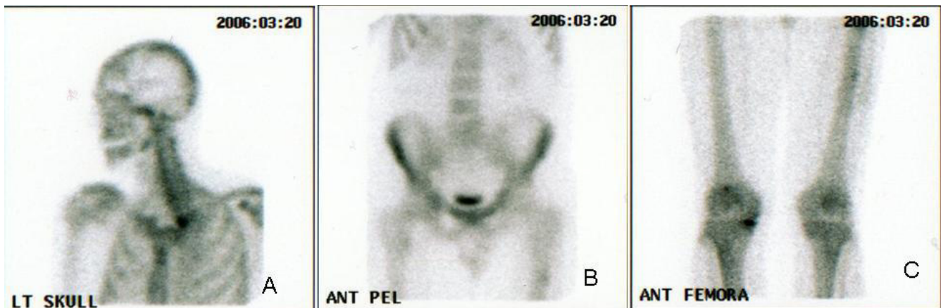
Figure 2 Technetium bone scan. No significant uptake in the skull (a), spine and pelvis (b), and proximal femora (c).

cases [6-9], to be insensitive to myxoid liposarcoma. Schwab et al. [8] have shown that even PET scans lack sufficient sensitivity to detect spinal involvement in this disease and recommended the use of total spine MRI when screening for metastases in MLS patients. Because bone secondaries are not common in soft tissue sarcomas, skeletal staging would not be routinely performed in many centres. Furthermore, relying solely on CT as a staging tool in these cancers might result in a significant number of metastases being missed. MRI, on the other hand, is an extremely sensitive tool to bone marrow replacement by abnormal tissue, as the high contrast between fat (marrow) and water (tumour) demonstrates metastatic lesions at an early stage [10]. We believe that whole-body MRI may be a more appropriate staging investigation of this particular tumour with unique clinical features. Because