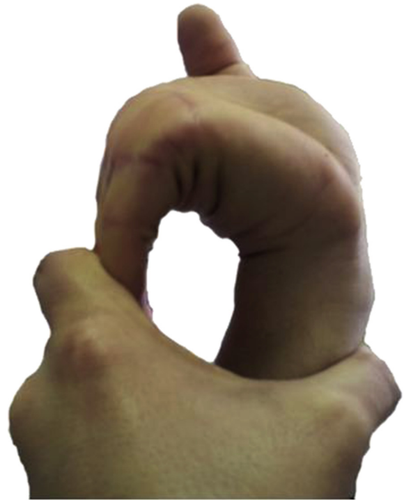
Fig. 2. Slightly hyperextensive of small joints of extremities.