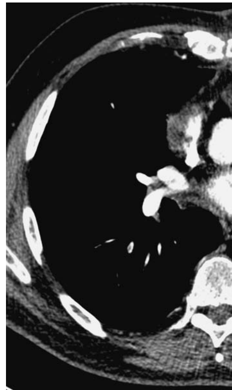
Fig. 2 Subsegmental embolus missed by primary readers

On a per-patient basis, the sensitivity of the CAD system was 94% (64/68) and the specificity 21% (44/210). CAD